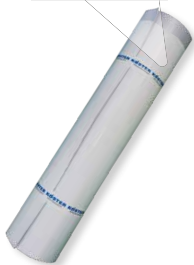
KÖSTER TPO SK (FR) Membrane