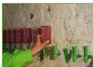
Installation of the cartridges