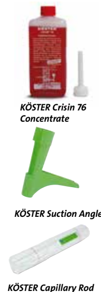
KÖSTER Crisin 76 Concentrate