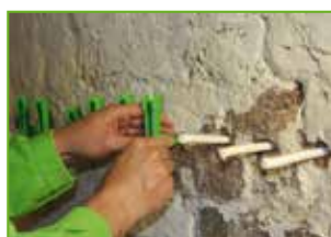
Installation of the KÖSTER Capillary Rods and KÖSTER Suction Angles