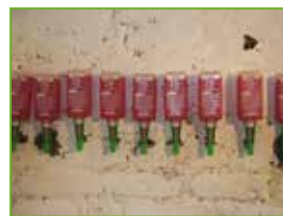
Automatic installation of the horizontal barrier