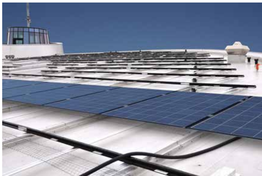
The KÖSTER BAUCHEMIE AG is a leading global producer of TPO and ECB roofing membranes with over 25 years experience.

KÖSTER TPO Membranes are UV-stable, aging resistant, and resistant against microorganisms. Due to their great compatibility, KÖSTER TPO Membranes are suitable for installation over bitumen roofs and for the installation over EPS insulation materials.